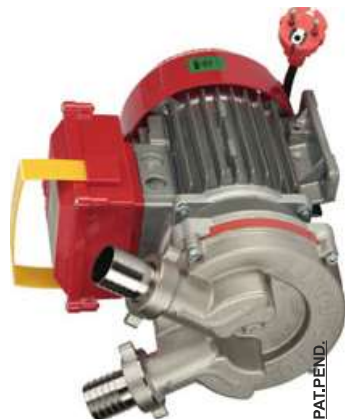
NOVAX 30 Oil