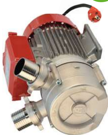
NOVAX 50 M