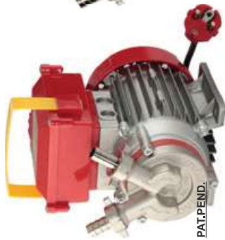
NOVAX 14 Oil