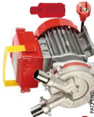
NOVAX 25 Oil