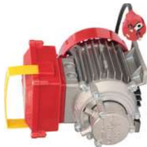
NOVAX 10 Oil